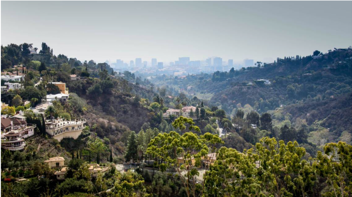
Valley of Bel Air luxury homes

The residential market has seen an influx of hotel chains. Although the hotel business has suffered since Airbnb's rise to prominence, the Four Seasons continues to be the first choice of any sophisticated and demanding traveler.